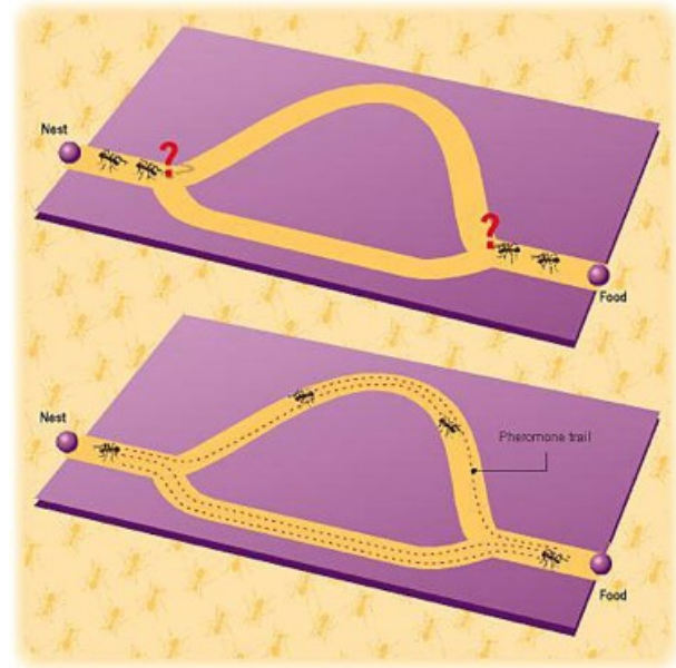
Figure 2. The binary bridge experiment

Another key feature of ant colonies is their ability to adapt "spontaneously" to changes in the environment. For