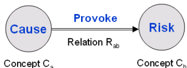
Fig. 3 the causal chain of PRIMA

The ontology of PRIMA contains a set of concepts describing risk and its insertion in a technical chain of work. Risk itself is described through 7 high level entities (or objects), the relations between those entities, plus relations with items external to risk (cost for example). Only two concepts and one relation were used for the experimentation in order to populate the causal chain of PRIMA and more specifically to instantiate the two concepts «Risk» and «Cause» and the relation «Provoke» that connects them.