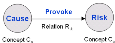
Fig. 3 the causal chain of PRIMA

The ontology of PRIMA contains a set of concepts describing risk and its insertion in a technical chain of work. Risk itself is described through 7 high level entities (or objects), the relations between those entities, plus relations with items external to risk (cost for example). Only two concepts and one relation were used for the experimentation in order to populate the causal chain of PRIMA and more specifically to instantiate the two concepts «Risk» and «Cause» and the relation «Provoke» that connects them.