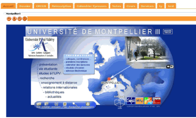
Figure 2. Digital desktop - April 2006 - Student