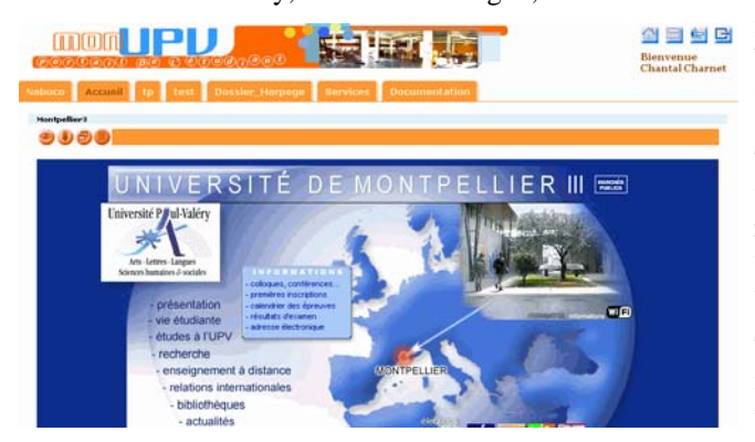
Figure 1. Digital desktop - April 2006 - Teacher

The desktop developed within the UNR-LR DW wear different user interfaces depending on the category of users and/or university, as showed in Fig. 1, 2 and 3.