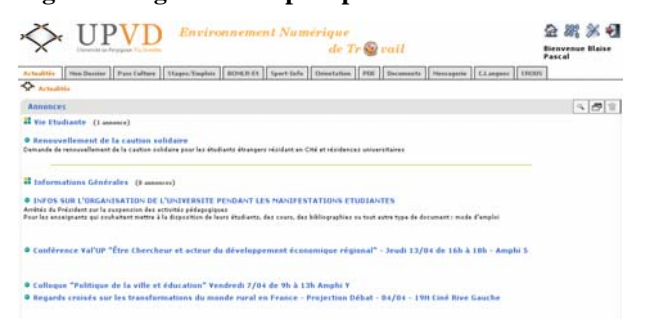
Figure 3. Digital desktop - April 2006 - Student