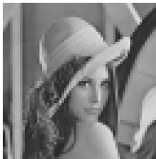
Figure 4. Attack in the selectively encrypted image (Fig.1.b) by removing the encrypted data.

replaced the encrypted AC coefficients with constant values. For example, if we set the encrypted AC coefficients of all blocks from Fig. 1.b which shows Lena with QF =