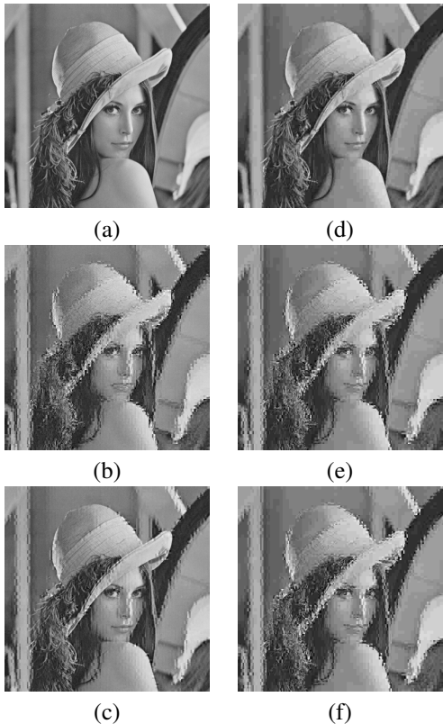
Figure 1. a) JPEG compressed image with QF=100%, b) Image (a) with C = 128 bits/block, c) Image (a) with C = 8 bits/block, d) JPEG compressed image with QF=10%, e) Image (d) with C = 128 bits/block, f) Image (d) with S = 8 bits/block.

We have applied simultaneously our selective encryption and JPEG compression as described in Section 3, on several images. In this section, we show the results of SE in the whole JPEG compressed image. The compressed JPEG Lena image 512 \times 512 pixels with a quality factor (QF) of 100 % is shown in Fig. 1.a and the compressed JPEG with a QF of 10 % is shown in Fig. 1.d.