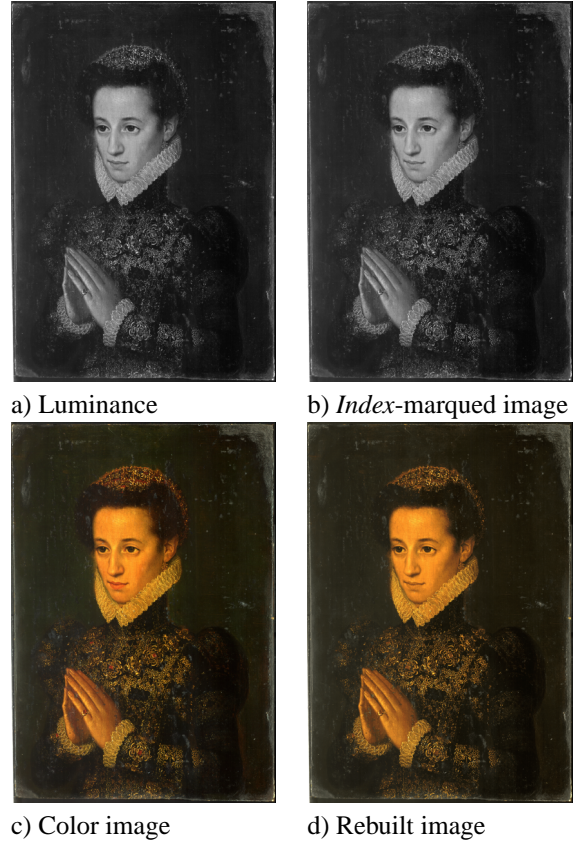
Fig. 1. Grey-level image hiding its color palette and the rebuilt color image.

Figure 2. This decomposition would have been impossible in a current desktop computer if proceeded on the full data. Indeed, the memory complexity necessary for the minimization of Equation 3 on the complete image is around 186 GB 4 . With a sub-sampling of 9604 pixels (around 10000 times less pixels) the memory complexity is falling to only 19 MB which is little 5 .