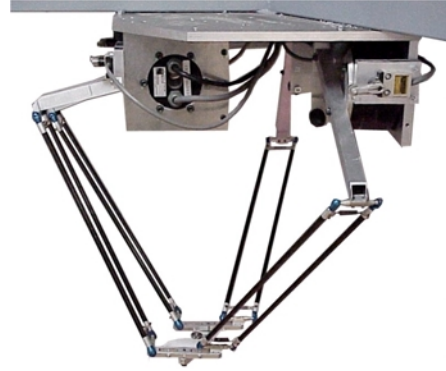
Fig. 1. H4 robot.

In this paper, the problem of dynamic robot parameter estimation is expressed with a model which is linear with respect to the physical parameters. The estimation problem is then stated as a linear interval constraint satisfaction problem (CSP). Interval fixed-point contractors make it then possible to compute a smallest box outer-bounding the solution set (Jaulin et al. , 2001).