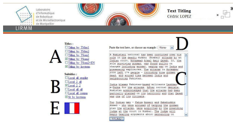
Figure 1: Screen shot: Application interface.

word in the corpus (IDF). We shall use the TF-IDF measure to calculate the score of every NP_{max} . This score can be the maximal TF-IDF obtained for a word of the NP ( TMAX ) either the sum of the TF-IDF of every words of the NP ( TSUM ). If a Named Entity is located among the NP_{max} , then our approach favors selecting of this NP as a title. Other methods are detailed in the online application (see Fig. 1).