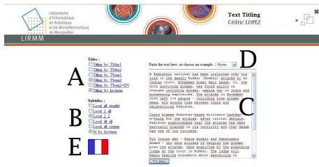
Figure 1: Screen shot: Application interface.

word in the corpus (IDF). We shall use the TF-IDF measure to calculate the score of every NP_{max} . This score can be the maximal TF-IDF obtained for a word of the NP ( TMAX ) either the sum of the TF-IDF of every words of the NP ( TSUM ). If a Named Entity is located among the NP_{max} , then our approach favors selecting of this NP as a title. Other methods are detailed in the online application (see Fig. 1).