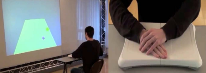
Figure 1. A player tries to stabilize the virtual ball using Wiiborad from Nintendo (Wii-balance game)

In order to experiment the adaptation technique we have chosen a game based on movements coordination on a 2D plane similar to the ones patients could encounter during their upper-limb rehabilitation programs. The proposed balance game is based on wii-board device. However, the wii-board was used with hands and not with feet. The proposed game aims to improve player's equilibrium capabilities while achieving the game goals. It is based on a task-oriented structure in which the goal is to stabilize a ball closest to a target (a cube) within a limited time. Depending on the target's location the player may find it more or less difficult to stabilize the ball (see Figure 1).