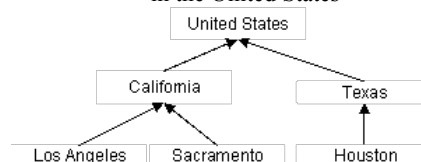
Figure 1 – An example of values for the 3 levels hierarchy in the United States