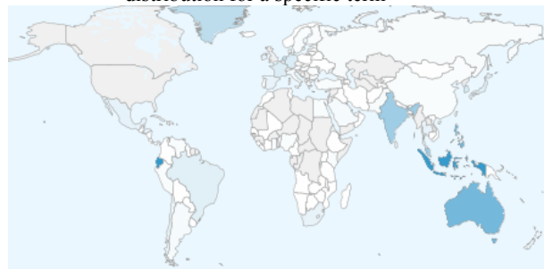
Figure 2 – An example of visualisation of the tweets distribution for a specific term