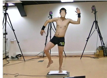
Fig. 1. Experimental setup for parallel measurement of Kinect-Wii board and Vicon-force plate.

The need for a high-end motion capture system, limits the application of the method. A mobile measurement tool with a small set up time would make the SESC method available for wide scale application, especially for in-home rehabilitation. CoM based balance training for the elderly could be presented in the form of a game to enrich the user’s