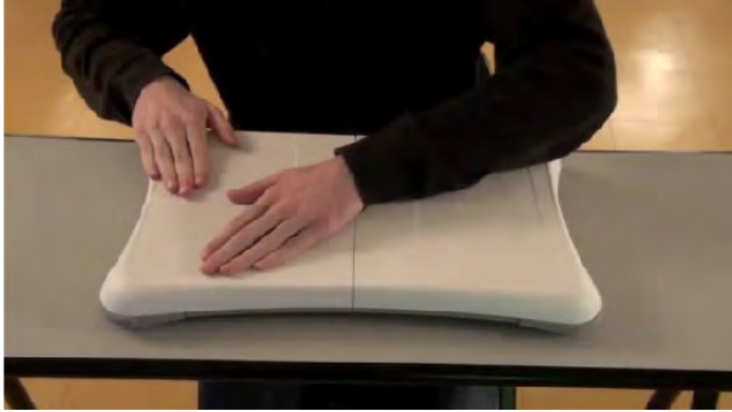
Figure 1. A player tries to stabilize the virtual ball using Wiiborad from Nintendo