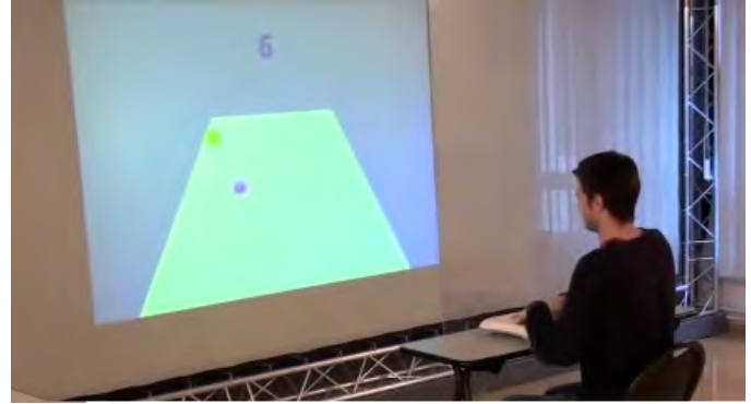
Figure 2. Wii-balance game

For instance, the reaching tasks objective can be amended while changing the success or failure conditions. That is, changing the target position or introduces constraints in terms of time, movement precision, and task accuracy. In this paper, we focus on the upper limb therapy and only therapeutic objectives related to the amplitude and range of arms are considered. In this context, all exercises, at the abstract level, follow a pattern of reaching targets placed on a 2D plane from a predefined origin. A time limit can also be introduced as an additional constraint. The movement has to be performed properly without compensation (some patients move their chest or shoulder to reach the target). This emphasizes the central role played by the therapist during the therapy session by assisting and correcting the patient's positions.