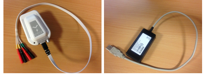
Fig. 2. Wireless stimulator (Left) with its control unit (Right)

M-wave lasting duration in real time, which could be rather difficult to detect, the MAVs of eEMG were averaged to be smoother (with a 0.8s time length moving window).