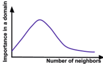
Fig. 1. Importance of a term in a domain

This approach aims to improve the precision of the top k extracted terms. As mentioned above, in contrast to the work cited before, the graph is built with a list of terms obtained according to the steps described in Sect. 3.1, where vertices denote multiword terms linked by their co-occurrence in the sentences in the corpus. Moreover, we apply the hypothesis that the term representativeness in a graph, for a specific-domain, depends on the number of neighbors that it has, and the number of neighbors of its neighbors. We assume that a term with more neighbors is less representative of the specific-domain. This means that this term is used in the general domain. Figure 1 illustrates our hypothesis. The graph-based approach is divided into two steps: