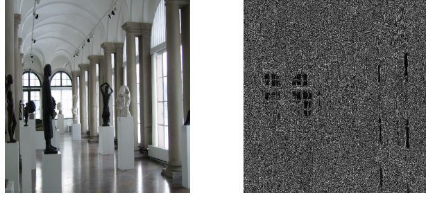
Fig. 1. Sample image and its residual noise

amount of incident light that strikes it. Slight imperfections in manufacturing introduce small amounts of noise in the recorded image.