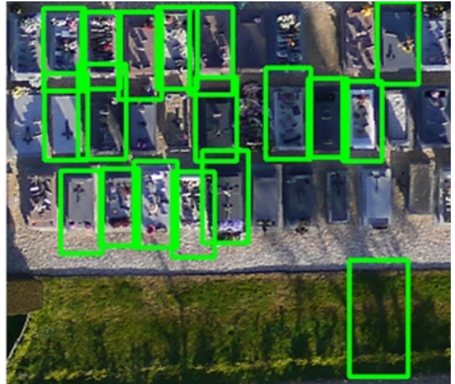
Fig. 2. Results of the Viola-Jones framework on an aerial view of a part of a French village cemetery (Saint-Gatien in the Basse-Normandie department). Green rectangles represent the bounding boxes of the detected tombs.

We performed a quantitative assessment of the two methods on the Saint-Gatien cemetery [2] which contains 636 tombs. With the Viola-Jones framework, the object recall is 49%, the object precision is 72%, and the object F-score is 53%. These indicators reveal a significant improvement compared to the watershed-based approach, where these parameters are respectively 24%, 23%, and 24%. This confirms that learning-based approaches give better results than approaches without