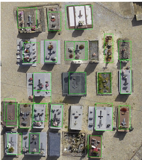
Fig. 6. Results obtained on an aerial view of a part of Lecey cemetery. Green rectangles represent the bounding boxes of the detected tombs.

into account. The method consists of keeping only the highly probable regions of sufficiently large sizes. If the obtained bounding boxes are too large, they are split, by taking the image gradients inside these boxes into account.