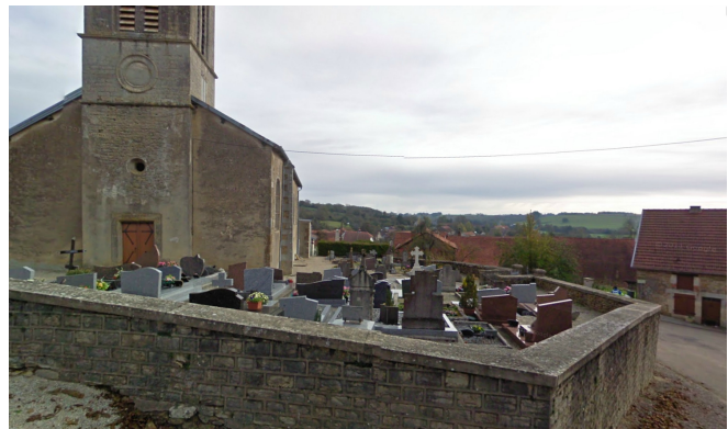
Fig. 4. A Google Street View image of Lecey cemetery taken in October 2010.

and a street view taken in front of the church entranceway (October 2010).