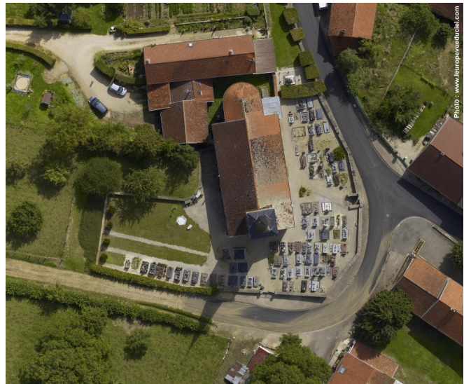
Fig. 3. An aerial view of Lecey cemetery taken in November 2011.

The Lecey cemetery will be used for the tests. Of course it does not belong to the learning database. Lecey is a small village of 7.85 km 2 with 223 habitants (2012 census), located in the Haute-Marne department. Its cemetery contains 93 tombs distributed all around the church. Figures 3 and 4 show an aerial view 4 of Lecey cemetery (taken in November 2011),