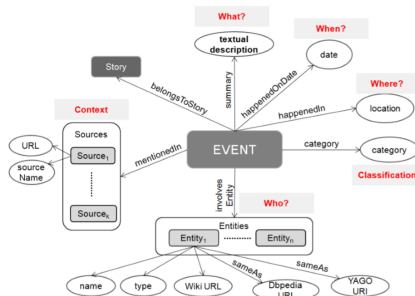
Fig. 2. The WikiTimes event resource model (taken from [4]).

Each event is anchored in the time and is characterized by several properties, described in a specific vocabulary, such as place and date of occurrence and involved entities, as well as additional information (Fig. 2).