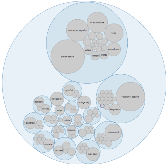
Figure 2. Visualization of communities and influencers.

The query execution can be monitored using the integrated system for real-time monitoring and analysis X-Ray (see Figure 3), where the user can view details for each operation running within the process, including relative start/end times of operation executions, intermediate cardinalities, rewritten queries, etc.