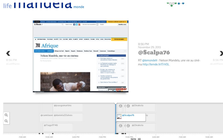
Fig. 3: Timeline with extracted patterns.

the maximum radius value which we defined as 10%. The minimum number of points was always set as 2, which means that if at least 2 retweets are reachable within the circle radius, they belong to the same cluster. As for the circle radius, it depends directly on the dissimilarity matrix. After executing tests upon all combinations, we concluded that the best value possible is 10% over the maximum value in the matrix. This is a critical value, since if it is too small the result may not return any clusters. On the other hand, if the value is too high, it will return a single cluster with all items, being therefore not representative.