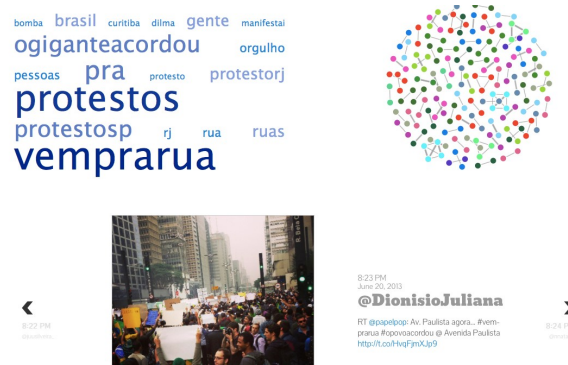
Fig. 5: Timeline and wordcloud for the Closed Swarm patterns found.

one example here, while the remaining results are available elsewhere 8 . Figure 4 shows the 18 paths of Closed Swarm found which are composed by 84 retweets. We can see that the majority of paths found are located in Rio de Janeiro and São Paulo. This reflects the importance of the protests in these cities. The most frequent words are "protestos" and "vemprarua" which mean protests and "come to street" (see Figure 5).