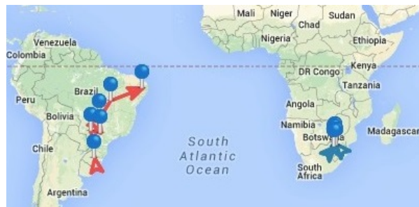
Fig. 1: Map close-up with moving patterns represented.

After obtaining the result from GetMove it is important to display the extracted patterns in an intuitive and explicit fashion. The RetweetPattern tool was designed to present the results extracted from the GetMove algorithm using one component for each one of the 4 dimensions. The first component is a map that represents the spatial patterns found with GetMove (see Figure 1). The user can observe several patterns: Closed Swarms, Convoys, Moving Clusters and Group Patterns. The choice of patterns affects the data represented in the map and, by extension, in the remaining visualization components.