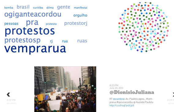
Fig. 5: Timeline and wordcloud for the Closed Swarm patterns found.

one example here, while the remaining results are available elsewhere 8 . Figure 4 shows the 18 paths of Closed Swarm found which are composed by 84 retweets. We can see that the majority of paths found are located in Rio de Janeiro and São Paulo. This reflects the importance of the protests in these cities. The most frequent words are "protestos" and "vemprarua" which mean protests and "come to street" (see Figure 5).