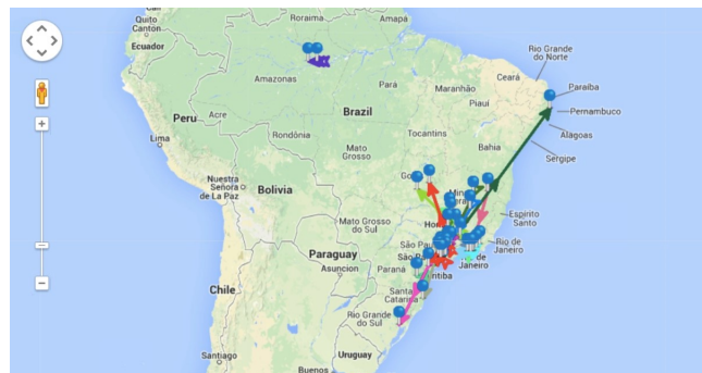
Fig. 4: Closed Swarm patterns found.

the maximum radius value which we defined as 10%. The minimum number of points was always set as 2, which means that if at least 2 retweets are reachable within the circle radius, they belong to the same cluster. As for the circle radius, it depends directly on the dissimilarity matrix. After executing tests upon all combinations, we concluded that the best value possible is 10% over the maximum value in the matrix. This is a critical value, since if it is too small the result may not return any clusters. On the other hand, if the value is too high, it will return a single cluster with all items, being therefore not representative.