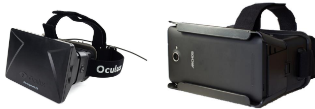
Fig. 2. Display devices: left Oculus Rift DK1, right Archos Vr Glasses

menting immersive visual experiences turned to another solution: the Archos VR glasses.