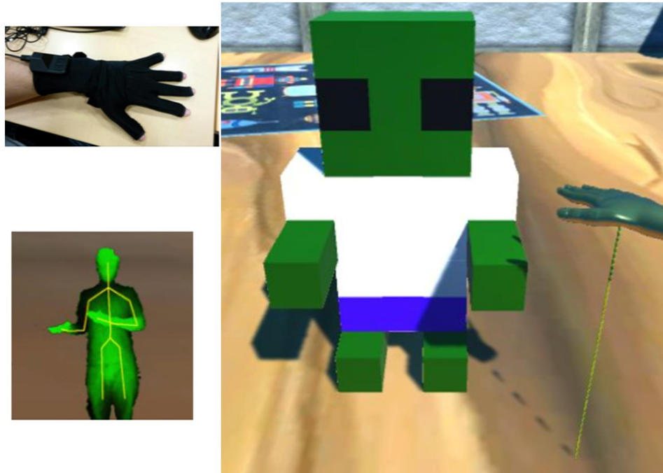
Fig. 5. In the δCréa-Mainö project, the virtual hand (right) is controlled by a combination of Kinect and Dat Glove controllers

There are several technical difficulties when implementing gesture recognition as detection of involuntary movements, lack of haptic feedback and user's fatigue. In addition to these technical challenges, it is very important to consider user acceptance. The gestures applications language has to be learned and adopted so it needs to be simple and intuitive.