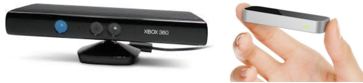
Fig. 4. Gesture recognition devices: left Microsoft Kinect, right Leap Motion

As display devices, low cost interaction devices have appeared in recent years. Designed primarily for video games, they address "natural" interfaces: intuitive, based on gesture recognition, having a very low learning curve. We can cite the Kinect and the Leap Motion, two wireless touchless devices that allow recognizing the position and movements of the user (Kinect) or of her hands and fingers (LeapMotion).