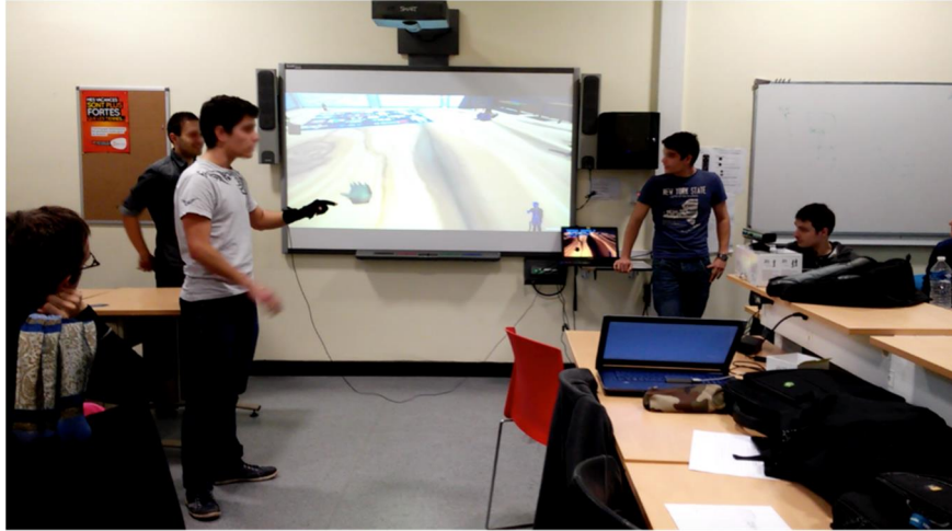
Fig. 1. Students presenting their work at the VR Lab

Videos showing several moments of the final project presentation day and several project trailers are available at our channel http://bit.ly/20XewVR .