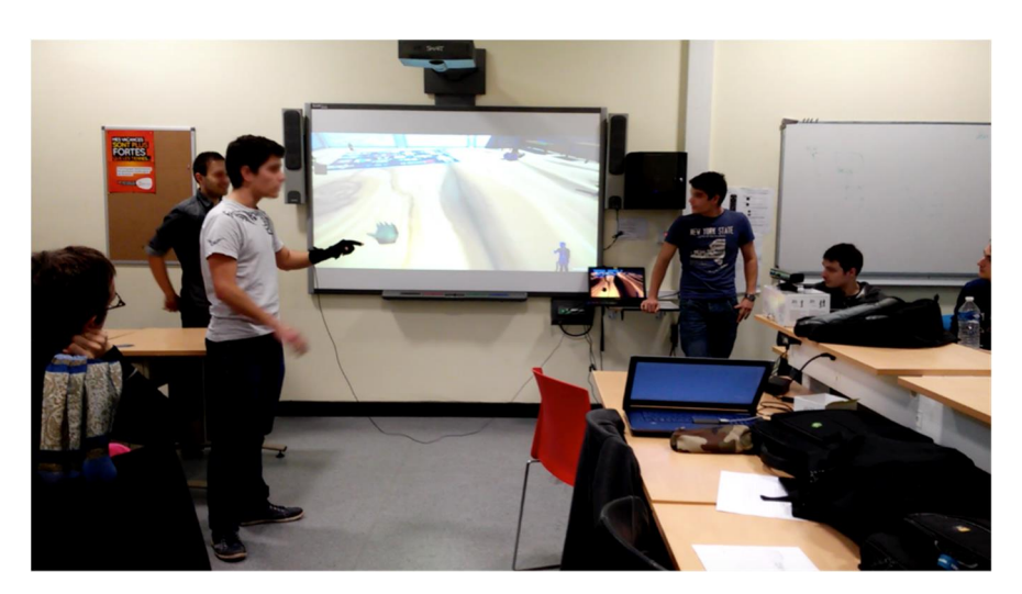
Fig. 1. Students presenting their work at the VR Lab

Videos showing several moments of the final project presentation day and several project trailers are available at our channel http://bit.ly/20XewVR.