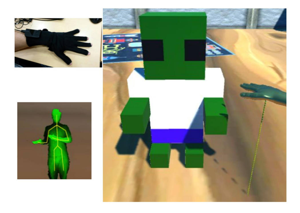
Fig. 5. In the õCréa-Mainö project, the virtual hand (right) is controlled by a combination of Kinect and Dat Glove controllers

There are several technical difficulties when implementing gesture recognition as detection of involuntary movements, lack of haptic feedback and userøs fatigue. In addition to these technical challenges, it is very important to consider user acceptance. The gestures applications language has to be learned and adopted so it needs to be simple and intuitive.