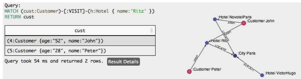
Fig. 2. Displaying the Result of a Cypher Query

We consider in this paper the manipulating queries in READ mode.