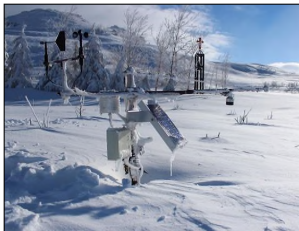
Figure 3. Snow weather stations in Laqlouq region, Lebanon

The three snow weather stations are located in three different regions (Mzaar, Cedars, Laqlouq) comprising sensors measuring temperature, snow height, relative humidity, precipitation, air pressure, wind speed and wind direction. The outdoor sensors are powered by solar cells as appears in Figure 3. Sensor observations are sent remotely via a TCP/IP connection through the Internet to the SOS server hosted in the O-LiFE observatory datacenter using