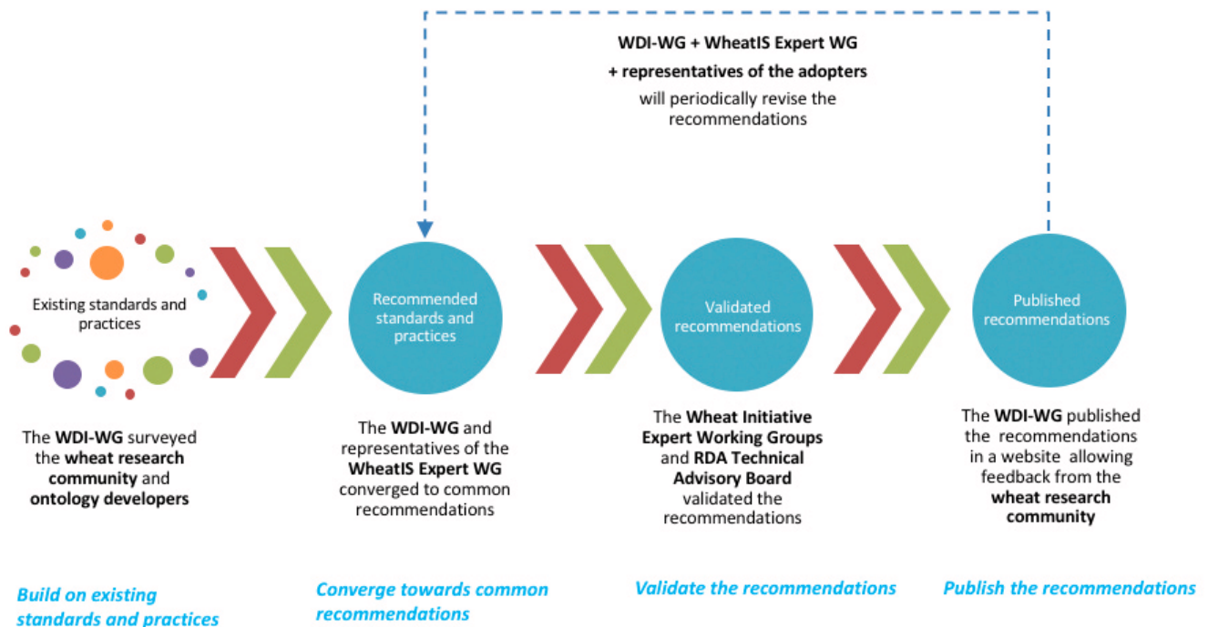
Figure 1. A community driven methodology for data interoperability guidelines design.

For the following data types of interest to the WDI-WG, the surveys confirmed the existence of adequate consensus regarding data exchange formats: DNA sequence and any associated variants, genome/transcriptome annotations, gene expression data, and physical maps. As such, the WDI-WG recommended the formats that were the most used and/or compliant with the most popular tools and/or already interoperable with other data formats. For example, the GFF3 file format ( http://gmod.org/wiki/GFF3 ) is found to be widely used by the community to represent genome annotations. Moreover, a Genbank-to-GFF3 script converter is available ( http://www.hpa-bioinformatics.org.uk/biosnippets/snippets/115 ), in addition to a GFF3 validator tool ( http://genometools.org/cgi-bin/gff3validator.cgi ). Thus, the WDI-WG recommended GFF3 for the representation of genome annotations.