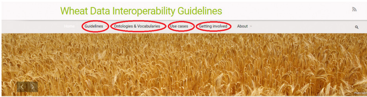
Figure 2. Main items in the menu of the wheat data interoperability guidelines.