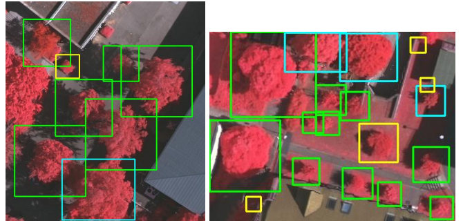
Fig. 3. Examples of the obtained results, in green we have the trees correctly localized, in blue the false negatives and in yellow the false positives.

We also computed the correlation of false positives between the different sources and we noticed that this correlation never exceeds 10% regardless of the sources studied. Thus, combining sources should reduce the number of false positives.