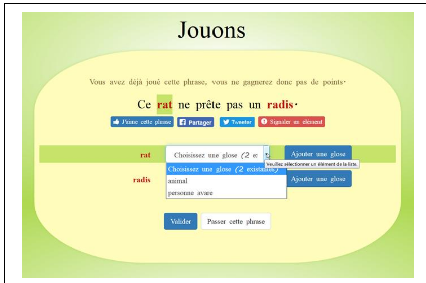
Figure 1: An Ambiguss play with the sentence Ce rat ne prête pas un radis .