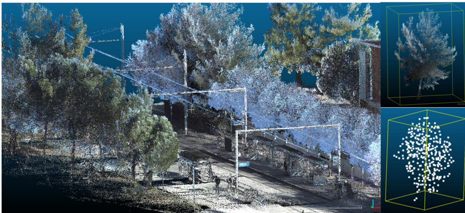
Figure 2: Left: part of the LiDAR acquisition of an urban scene. We can recognize a tramway railway and trees. Right up: a tree was manually isolated in the point cloud (160,000 points). Right down: a downsampled version (267 points) by voxel-grid filter is used for classification.

We also performed a LiDAR acquisition with a Leica Pegasus backpack 3 carried by a walking person. The acquisition itinerary, about 200 meters long, was executed back and forth. In the point cloud (see Figure 2, left), we can recognize a tramway station, some trees with and without leaves and a small residential area. The resulting 3D point cloud contains over 27 million points and we were able to manually isolate 160 urban objects. The resolution of these objects is several times higher than objects in dataset A: more than 1,000 points for a person and more than 20,000 points for most of the trees. The resulting dataset B is composed of 75 trees, 39 cars, 8 traffic sign/light, 23 poles and 15 persons. We did not isolate building facades or noise artifacts.