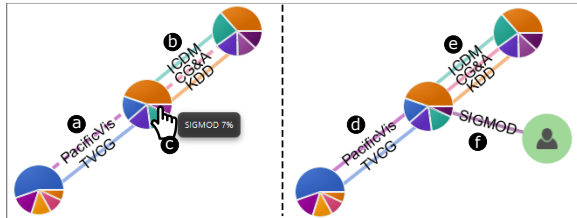
Figure 2: At the left, visual elements on the query depict suggested edges. At the right, the query including newly added suggested edges.

In order to accept a suggested edge, the user clicks over the internal or external edge. A new internal edge is displayed as a continuous line (Fig. 2(d, e)). A new external edge is displayed as a link to a node in the direction of its slice (Fig. 2f SIGMOD link).