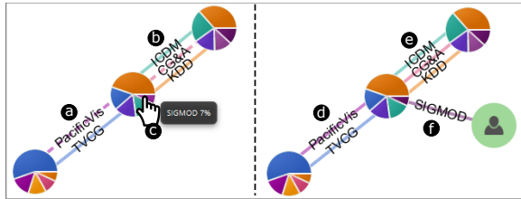
Figure 2: At the left, visual elements on the query depict suggested edges. At the right, the query including newly added suggested edges.

In order to accept a suggested edge, the user clicks over the internal or external edge. A new internal edge is displayed as a continuous line (Fig. 2(d, e)). A new external edge is displayed as a link to a node in the direction of its slice (Fig. 2f SIGMOD link).