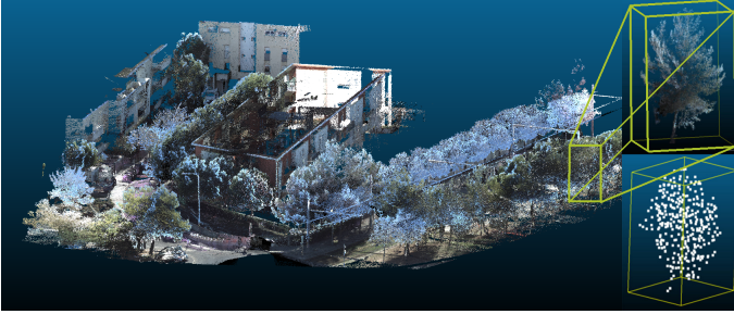
Fig. 2: Overview of the acquisition we performed: we can see some trees, poles and a small residential area.

an illustration of the extraction of a set of points, standing for a tree object, and its sub-sampling to a 512-points cloud without the colours, from SetB.