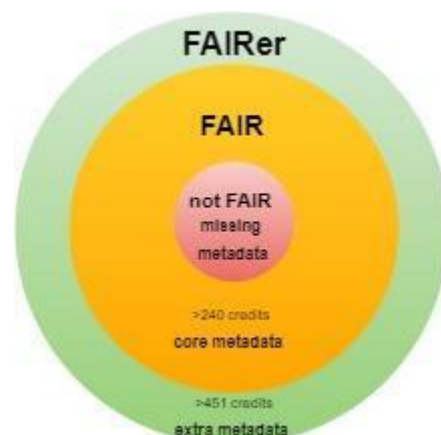
Fig. 2. Not FAIR, FAIR or FAIRer: using the metric of the integrated quantitative grid.

Qualifying the degree of FAIRness of a semantic resource or even comparing it with other semantic resources necessarily implies the use of a metric delimiting the range of values for each qualification (e.g., not FAIR, FAIR, or FAIRer). In that context, our proposed integrated quantitative grid allows defining thresholds . For instance, the median value of the resulting total credits can be considered a minimal threshold to be FAIR. A semantic resource with a degree/score under this threshold will not be considered FAIR. Similarly, a semantic resource might be considered as “FAIRer” if it is described with extra metadata properties. In other words, answering the question: “ how much is a semantic resource FAIR? ” becomes possible with such a metric. In our grid, the total credits is 478, so a first threshold could be at 240 ( 478/2+1 ) and the second one at 451 ( 478-27 ) as illustrated in Fig. 2.