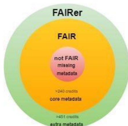
Fig. 2. Not FAIR, FAIR or FAIRer: using the metric of the integrated quantitative grid.

Qualifying the degree of FAIRness of a semantic resource or even comparing it with other semantic resources necessarily implies the use of a metric delimiting the range of values for each qualification (e.g., not FAIR, FAIR, or FAIRer). In that context, our proposed integrated quantitative grid allows defining thresholds . For instance, the median value of the resulting total credits can be considered a minimal threshold to be FAIR. A semantic resource with a degree/score under this threshold will not be considered FAIR. Similarly, a semantic resource might be considered as “FAIRer” if it is described with extra metadata properties. In other words, answering the question: “ how much is a semantic resource FAIR? ” becomes possible with such a metric. In our grid, the total credits is 478, so a first threshold could be at 240 ( 478/2+1 ) and the second one at 451 ( 478-27 ) as illustrated in Fig. 2.