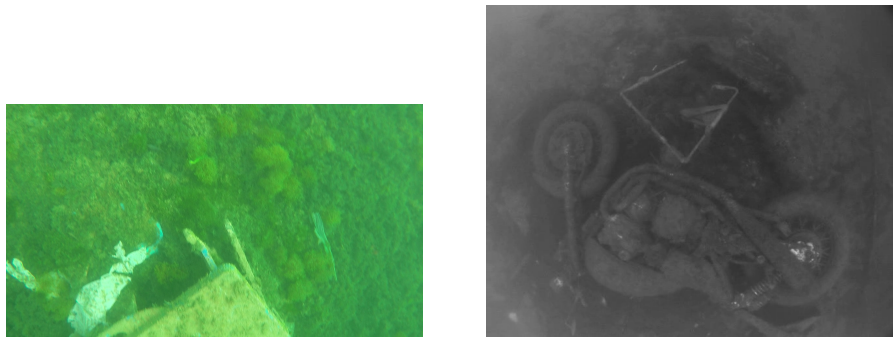
Fig. 5. Images from AquaLoc [3].

mance. Indeed, the larger the database is, the least the bad quality examples influence the overall performance. We see relatively low performances for TrashCan and UNO models regarding covariate shift testing. Indeed, JAMSTEC and AquaLoc images are very different as the color and object shapes impact the overall distribution. Moreover, a biological phenomenon called marine biological fouling makes the detection task more difficult. Marine fouling occurs when organisms grow on underwater objects. However, because it almost does not form in deep water due to the lack of light, JAMSTEC images do not cover that variability. In order to keep the gain having a pre-trained network on the UNO database but targeting use on images having a domain shift, one can envisage performing domain adaptation [14], or generative methods [6]. This is postponed to future works.