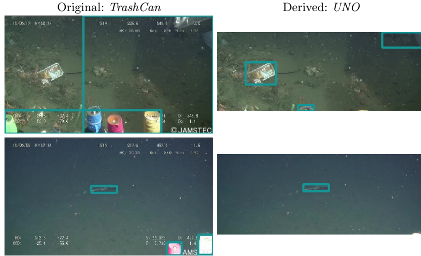
Fig. 2. Images and annotations from TrashCan (left) and UNO (right) datasets. We can see how the UNO images were cropped in order to delete artefactual content (in particular the text) and how some BB were resized or added to fit better the non-natural objects.

After the process, the UNO dataset consists of 279 video sequences with 5,902 frames and 10,773 bounding boxes labeled with the unique Non-natural object class.