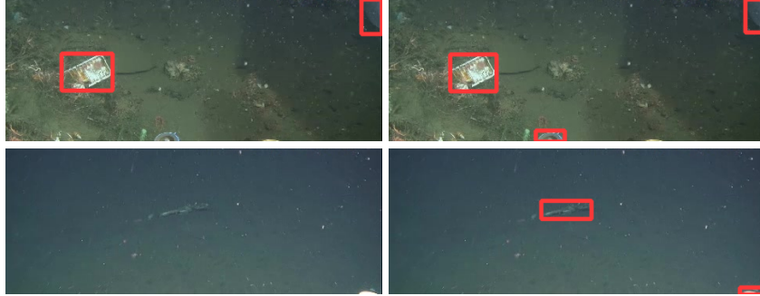
Fig. 4. Localization results on UNO images for models trained on the same subpart of TrashCan and UNO datasets, respectively.

Finally, we give the UNO model evaluation on its validation set in the fourth row. The results increase by almost 10 points ( P=68.7 \pm 4.3\% , R=66.2 \pm 1.5\% , F1=67.3 \pm 1.5\% , and mAP@.5=68.8 \pm 1.2\% ). Moreover, when trained on the UNO database, YOLOv5 obtained much lower standard deviation results. UNO has thus better properties when it comes to comparing networks.