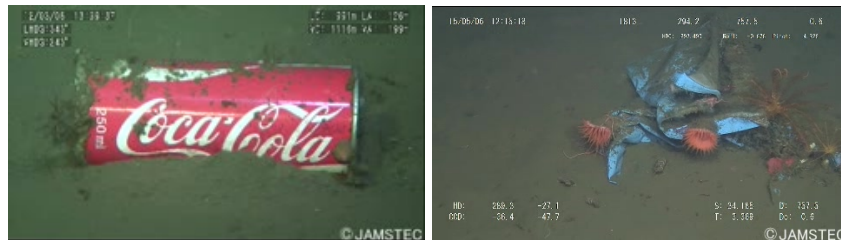
Fig. 1. Images from the DeepSeaWaste (left) and TrashCan (right) datasets.

The availability of video datasets as DeepSeaWaste [5] 4 or TrashCan [7] 5 allowed researchers to design DL networks to classify [16] [13] and localize [11] [9] macro-litter within underwater images. Figure 1 shows some images from these two datasets.