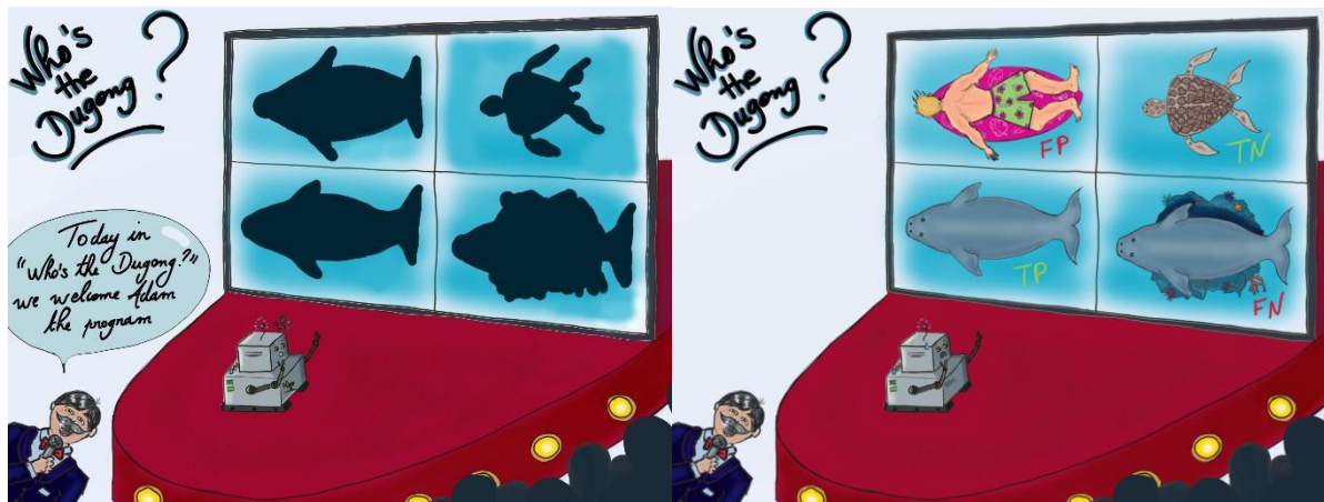
Figure 3 – Four categories of results were obtained by the AI program as it tried to recognize dugongs in images: true positive (TP), false positive (FP), true negative (TN), and false negative (FN). The program was then given an overall score for how well it could recognize dugongs.

The program's results were considered correct if the numbers of FPs and FNs were very low. The numbers of TPs, FPs, TNs, and FNs allow researchers to better understand the AI program's mistakes, which can help them find ways to improve the program.